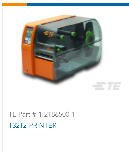
TE Part # 1-2186500-1 T3212-PRINTER