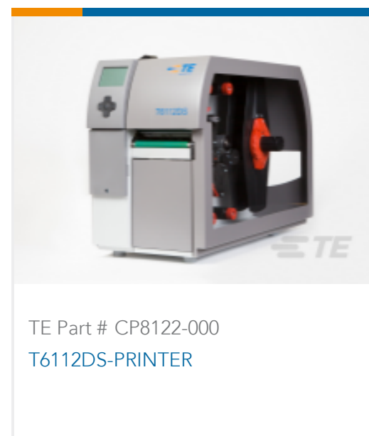
TE Part # CP8122-000 T6112DS-PRINTER