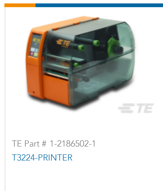
TE Part # 1-2186502-1 T3224-PRINTER