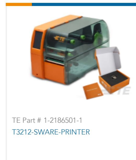
TE Part # 1-2186501-1 T3212-SWARE-PRINTER