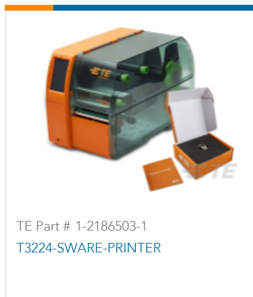
TE Part # 1-2186503-1 T3224-SWARE-PRINTER